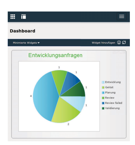
Example Dashboard of the 446 Plattform®

The new software releases from Isonet are also convincing. Thus, the dashboard introduced in 2016 provided significant improvements by providing an overview of orders and further insights into order processing.