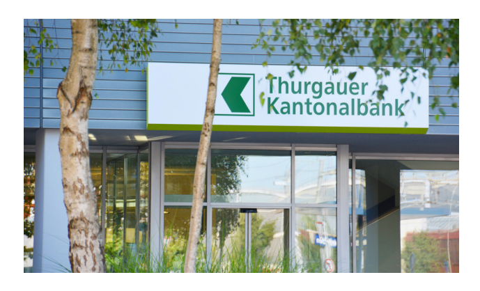
The Thurgauer Kantonalbank has its headquarters in Weinfelden, Switzerland

Isonet's approach: Not only to transfer the processes into the software, but also to train the employees of the Thurgauer Kantonalbank in working with the workflow designer and other modules of the platform.